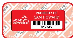
Destructible asset label: 50mm x 20mm. Cost: £0.14