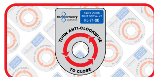
Bespoke cut TPM label: 75mm x 100mm. Cost: £0.60