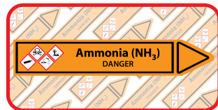
CLP / GHS pipemarkers: 525mm x 95mm. Cost: £3.64