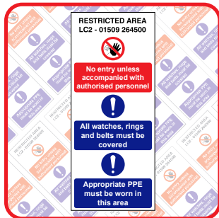
Branded safety label: 100mm x 236mm. Cost: £1.64