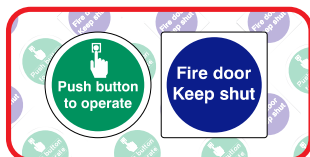
Safety label: 80mm x 80mm Cost: £0.37