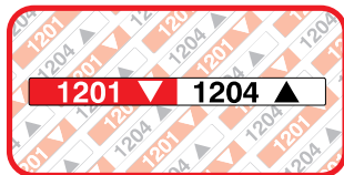
Racking label: 490mm x 45mm Cost: £1.41