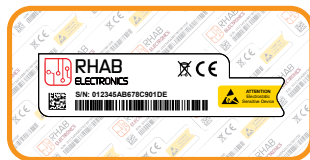
Low Surface Energy Polyester label: 70mm x 18mm. Cost: £0.13