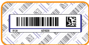
Cryogenic barcode label: 60mm x 15mm. Cost: £0.08