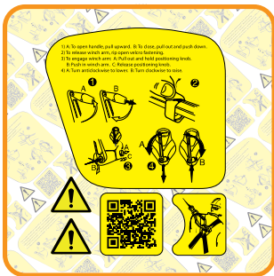
Yellow Polyester label set: 100mm x 125mm. Cost: £0.74