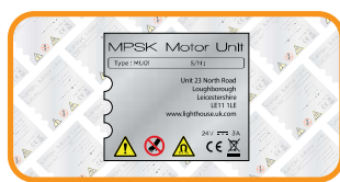
Silver / Grey Polyester label: 45mm x 45mm. Cost: £0.18