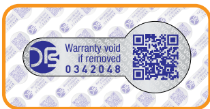
Tamper Void label: 70mm x 30mm. Cost: £0.25